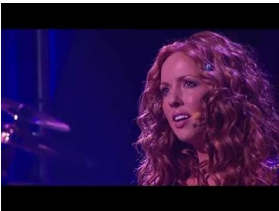
Celtic woman live at morris performing arts center. Celtic woman live at morris performing arts center full.